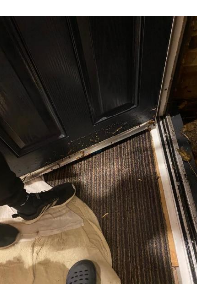
Left: Flooding to 134a hallway and carpet damage