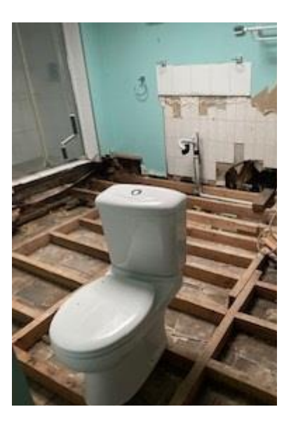
Right: Bathroom floor removed due to damage from flood water at 113