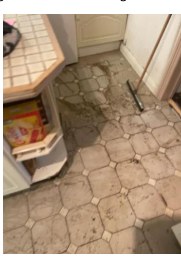
Right: Sediment left from flooding to Kitchen at 113

Left: Sewage outside 132 and 134a that spilled onto the properties